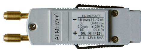
Measuring connector FDA602S1K / S6K