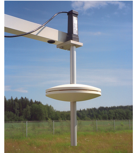
The PTB210 paired with the SPH10 Static Pressure Head.

The Vaisala BAROCAP® Digital Barometer PTB210 is a reliable outdoor barometer that withstands harsh conditions.